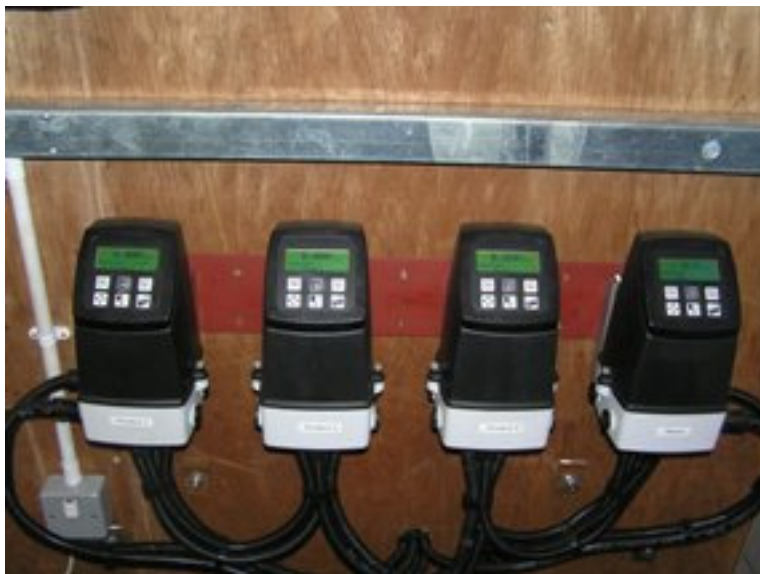
Picture 1.6. Flow meter displays.

Herbicide product rate selection is set using switches mounted on the low voltage electrical cabinet within the machinery compartment and rates of between 2 and 10 litres are available to suit the products being applied. (See picture 1.7).