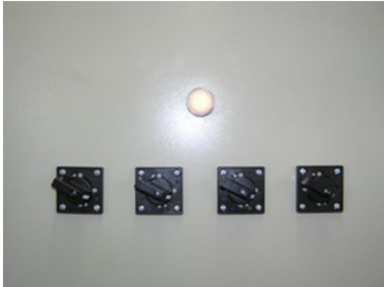
Picture 1.7. Product rate selection switches.