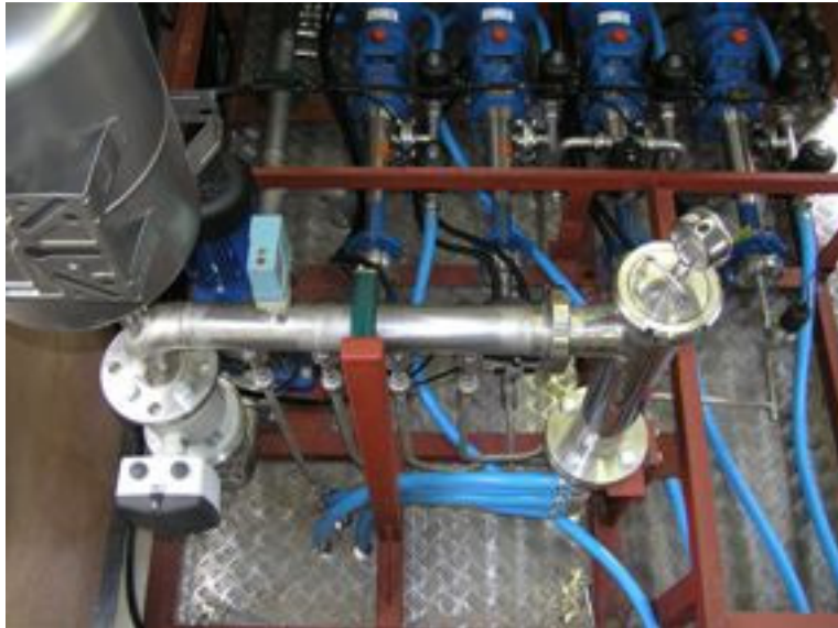
Picture 1.5. The chemical mixing system.