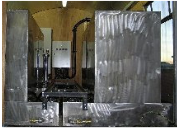
Picture 1.3. Herbicide storage tanks.