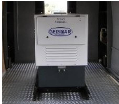
Picture 1.2. Diesel Generator.

Electrical power is supplied from a three phase 28 KVA diesel generator (See picture 1.2) via a distribution board located in the operator’s compartment. Fuel for the generator is fed from the existing fuel tanks located under the vehicle.