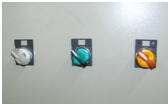
Picture 1.4. Replenishing / emptying control switches

The chemical mixing system is mounted on a frame situated adjacent to the herbicide storage tanks in the machinery compartment. The system has four injection pumps, a main water pump, product flow meters, a water flow meter, an accumulator tank, an injection manifold and a filter and mixing chamber. (Picture 1.5)